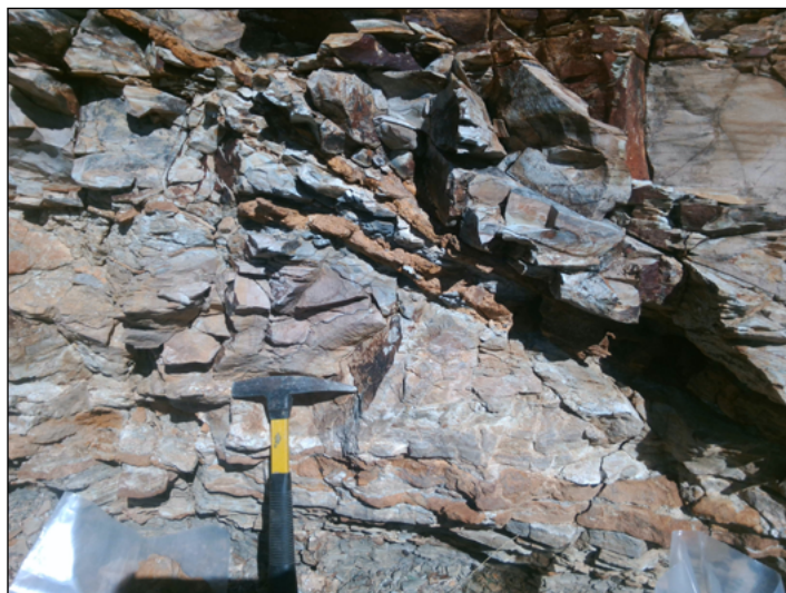
Figure 3. Rusty sills and dikes of REE-mineralized carbonatite that intruded Mowry Shale in Petroleum County, Montana.

All REEs, including La, co-crystallize in the same minerals due to their geochemical similarities. Ore minerals are typically phosphates or carbonates such as monazite or bastnaesite, respectively. These occur in exotic intrusive rocks such as carbonatite, peralkaline granitoids, and some types of pegmatite. La grades are typically higher in carbonatite. Other critical minerals that can occur in these rare rock types are fluor spar ( \text{CaF}_2 ), barite ( \text{BaSO}_4 ), niobium (Nb), tantalum (Ta), scandium (Sc), titanium (Ti), uranium (U), and zirconium (Zr). Certain dense La minerals, specifically monazite, can resist weathering and become concentrated in placer (mineral sands) deposits along with the other REEs, Zr, Ti, Nb, and Ta.