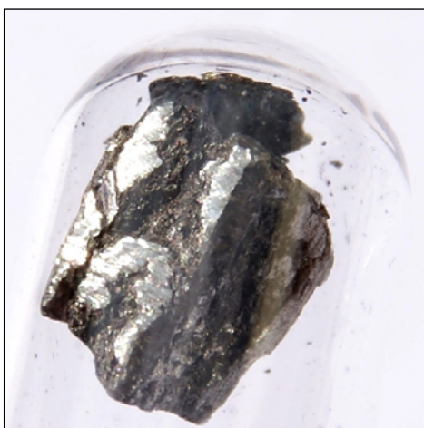
Figure 1. A 1-cm-wide sample of refined La metal in a glass vial.

The soft, silvery metal oxidizes slowly. La compounds are used as catalysts, glass additives, igniters, and specialty electrodes.